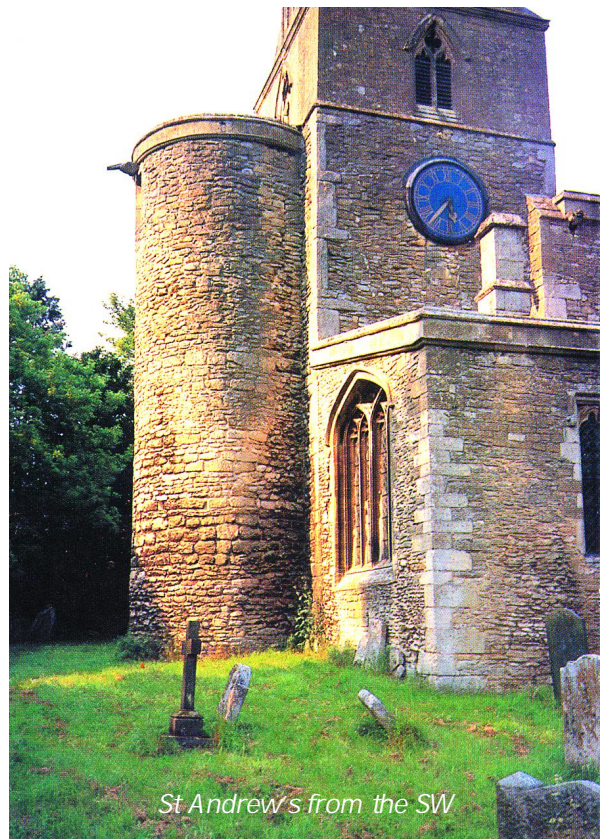
St Andrew's from the SW