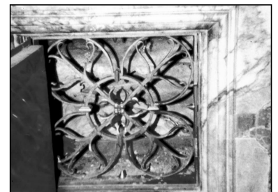
Above: The door of the shrine in the north wall of the sanctuary