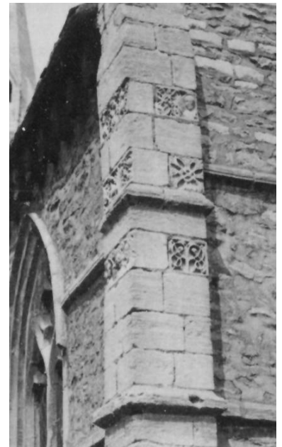
Top right: Looking West