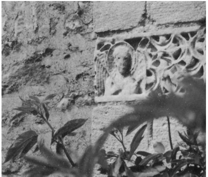
Bottom: Carving on East wall